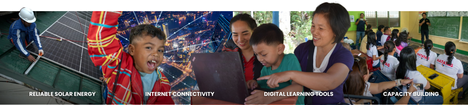
RELIABLE SOLAR ENERGY